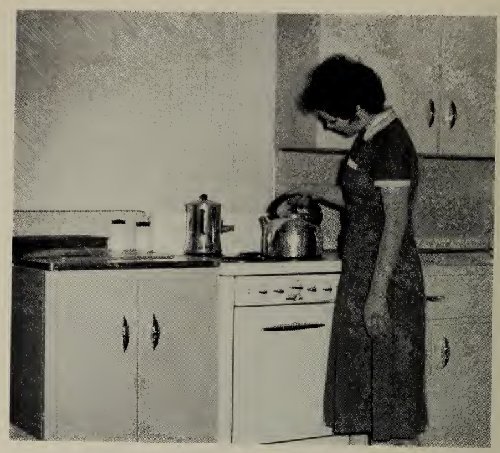
Corner in Home Economics Department, Mercer Reformatory for Women.